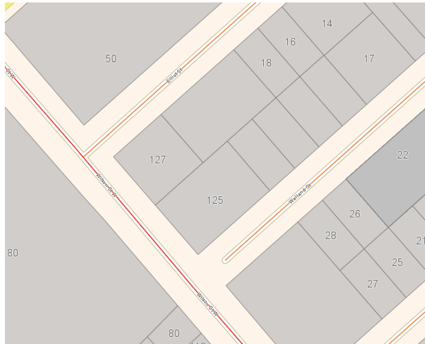
Figure 4 – Town of Perth Official Plan Schedule B – Transportation (Red: Arterial Road, Orange: Local Road)

The Town of Perth’s Official Plan strives to balance the aspirations of Perth within the broader context of provincial interest with the goal to provide appropriate decision-making framework for land use development within the Town. The development strategy for Perth lists several components or objectives in Section 1.2: