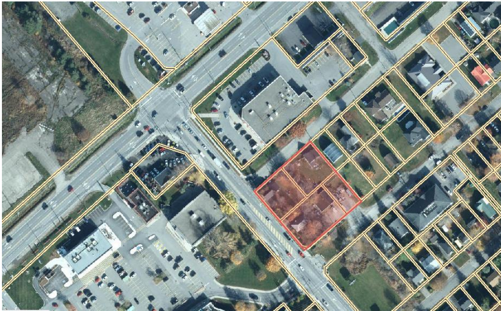
Figure 1 – Aerial View of the Subject Property

The subject property has frontage on three streets, including Wilson Street to the west, Elliot Street to the north and the Welland Street road allowance to the south. The Welland Street road allowance is currently unopened to vehicle traffic, and located at an existing three-way intersection that provides access to the Perth Mews Mall on the west side of Wilson Street. The property measures approximately 3,596 sqm in size, with approximately 61 metres of frontage on Wilson Street and approximately 59 metres of frontage on both Elliot Street and Welland Street. The total depth of the lot is 44.0 metres. A sight triangle has already been taken out of the southwest corner at the intersection with Welland Street. There are no significant natural heritage features identified on the property which is serviced by municipal water, sewer and storm infrastructure. Shoppers Drug Mart is located to the north of the subject property, with residential uses located to the east and south. While the majority of housing in the area is characterized as low density, there are a number of higher density apartment buildings in the neighbourhood. The subject property represents a transition between the residential uses to the south and east, and the existing commercial uses to the north and west.